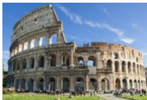
The Colosseum in Rome today