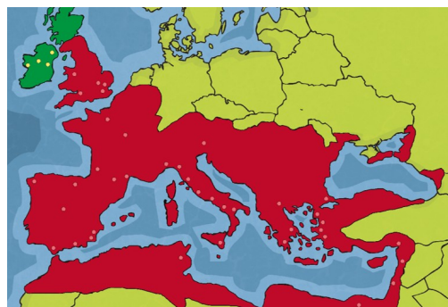
Map of the Roman Empire in 43AD